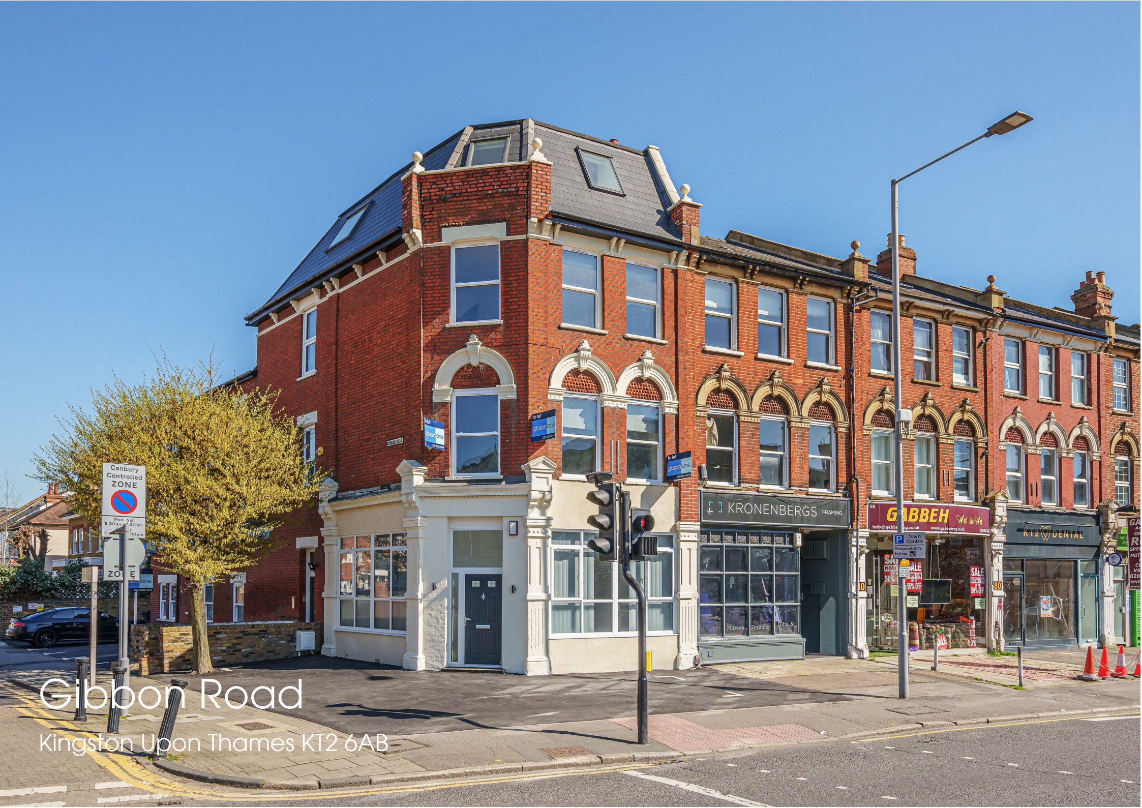
Gibbon Road Kingston Upon Thames KT2 6AB

34 Richmond Road Kingston upon Thames Surrey KT2 6ED www.gibsonlane.co.uk Tel: 020 8546 5444